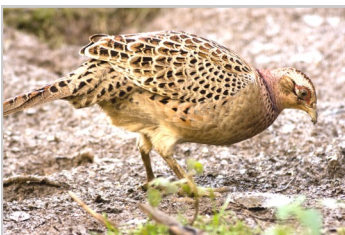
FEMALE COMMON PHEASANT Phasianus colchicus

The adult male Amherst's is 100-120cm (39-47 inches) in length, with the tail being 80cm (31½ inches) of the total length. An adult male is unmistakable with its black and silver head, long grey tail and rump, and red, blue, white and yellow body plumage. The barred silver "cape" can be raised in display. The male has a gruff call in the breeding season.