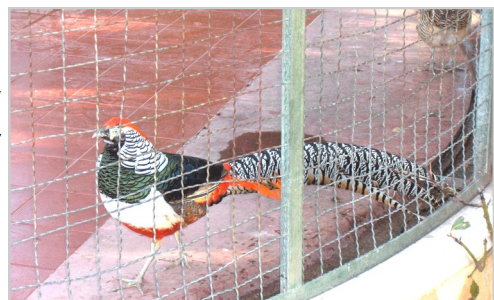
Amherst X Golden. In a pure Lady Amherst's Pheasant, the red crest would begin well back on the head, not at the beak, and the belly would have no red.

Amherst's are ground-feeders, their diet predominantly consisting of grain, leaves and invertebrates. They can fly, but prefer to run; if startled they suddenly burst rapidly upwards with a very distinctive wing sound.