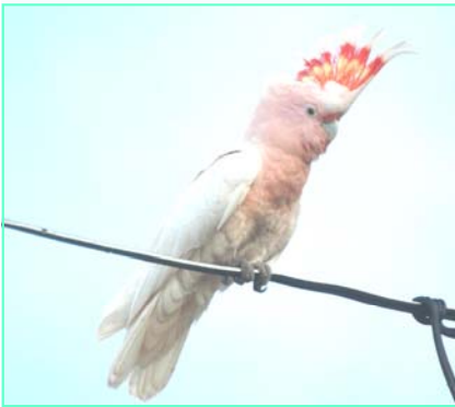
MAJOR MITCHELL'S COCKATOO BOWRA QUEENSLAND

Major Mitchell's Cockatoo, Lophocroa leadbeateri , also known as the Pink Cockatoo or Leadbeater's Cockatoo is a medium-sized cockatoo restricted to arid and semi-arid inland areas of Australia. It was usually placed in the genus Cacatua . But recent research suggests this species should be placed in a monotypic genus, Lophocroa , (Brown & Toft, 1999).