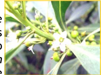
NAIO TREE FLOWER

They lived in forested areas mainly on the Ohialele Plateau, where it could usually be found before its disappearance in 1963. It used its short blunt beak to extract insects from old Naio trees, Myoporum sandwicense . The main portion of its diet was beetle larvae and caterpillars. However, it occasionally sipped nectar from flowers, including those of the Naio. The exterior of its nest was reportedly composed of moss.