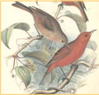
AN ILLUSTRATION FROM 1890 Artist: F.W. Frohawk

The Kākāwahie or Moloka‘i Creeper, Paroreomyza flammea , was a species of finch in the Fringillidae family. Formerly occurring on the Hawaiian island of Moloka‘i, it is now extinct. It was 13cm (5½”) in length with markedly clawed toes. This bird received its Latin name flammea (flame) as the males were scarlet red all over. The female had more of a brownish tinge to its abdomen. Its call was a “chip chip” rather like someone cutting wood in the distance. They were discovered in the late 19th century when Wilson, a British ornithologist, shot a female and two males. These birds were named Paroreomyza flammea because of the resemblance to a ball of fire as it flew from tree to tree in search of food.