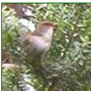
This wild Superb Blue Wren allowed approach to within 60 to 70cm.

species housed in the spacious aviaries. Many of the species observed had young in the nest, or on the wing.