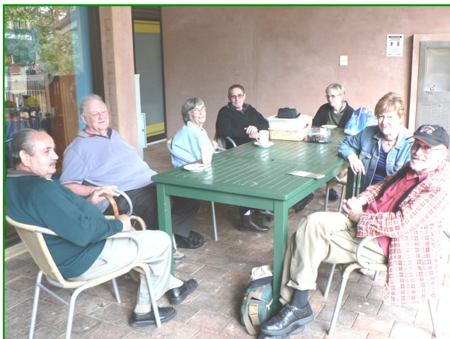
A FEW OF THOSE PRESENT

On Sunday, November 22nd, a small but dedicated group of members braved the somewhat inclement weather to visit the Cleland Wildlife Park for the Society's annual picnic. Luckily the rain held off for most of the day, with the few light showers that fell doing nothing to deter those present.