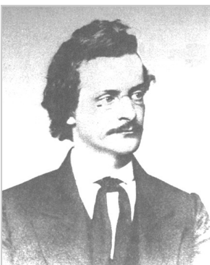
WILLIAM STIMPSON 1832-1872

The Bonin Grosbeak was discovered by the Beechey Pacific expedition, which collected two specimens on Chichi-jima in 1827. The following year, Friedrich von Kittlitz, the only naturalist to have seen the species alive, took several more specimens, but only gave the locality "Boninsima" ( ie. Bonin-shima). When the Rodgers-Ringgold North Pacific Exploring and Surveying Expedition called at Chichi-jima in 1854, the American naturalist William Stimpson could not find the species. However, he did find rats, goats, cats, sheep and dogs, as well as pigs that were probably left there by Beechey