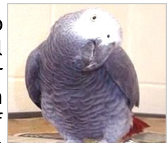
"Alex" the African Grey one of the 14 parrots that showed the ability to keep time with music.

The scientists surmise that the bird's ability to dance might be shared with the ability for vocal learning and vocal imitation. To test their theory, the researchers analysed more than 1000 videos of dancing animals on YouTube. Of these only 33 were considered to be moving to the music's beat. The 33 were made up of 15 species, all of which are vocal learners, and comprised 14 parrots and an Asian Elephant.