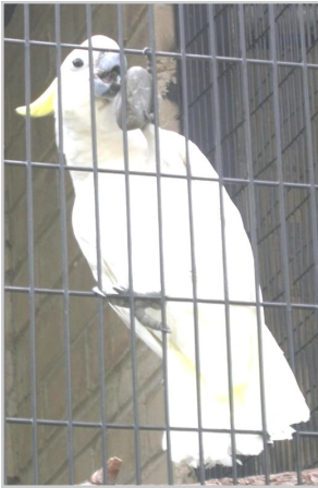
ELEONORA COCKATOO A common species in overseas aviculture

A study in the United States, published in the journal Current Biology , claims some parrots have a near-perfect sense of rhythm and can move their bodies and tap their feet in time with music.