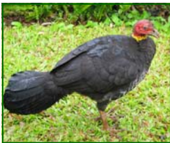
Brush Turkey

Two well-known megapodes are the Malleefowl, Leipoa ocellata , and the Brush Turkey, Alectura lathami .