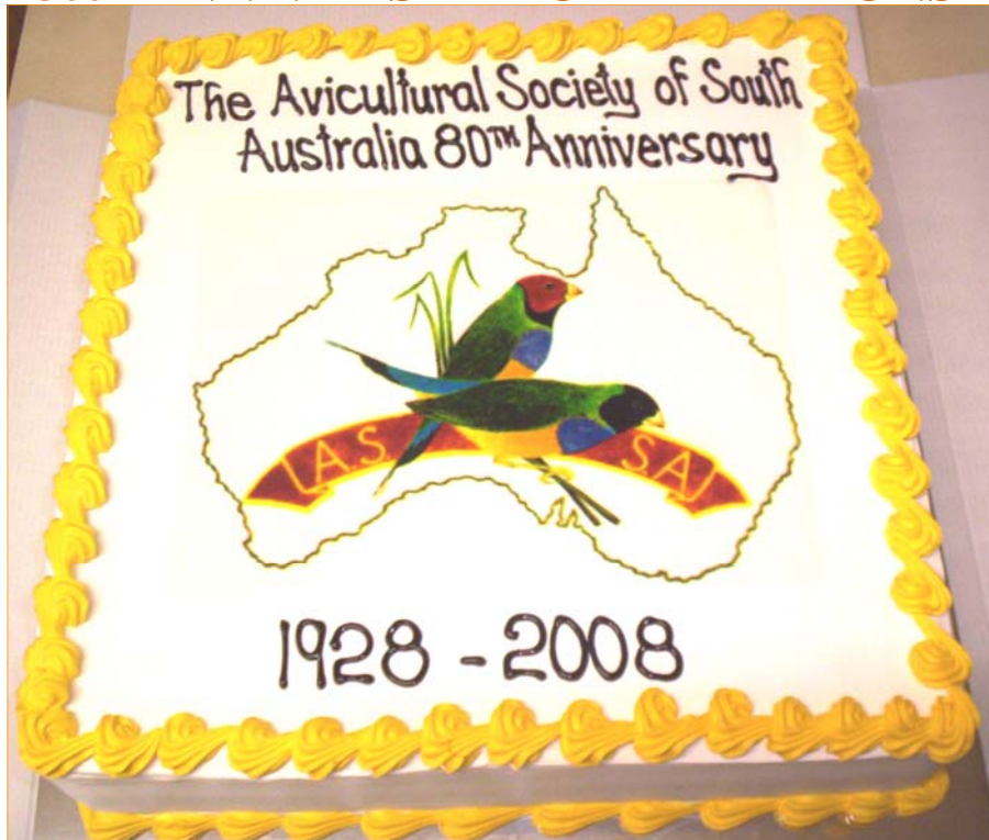
The 36cm Black Forest Cake from Adelaide Designer Cakes Delicious, and eaten to the last crumb!