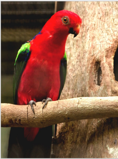
MALE AT JURONG BIRD PARK, SINGAPORE

The Papuan King Parrot, Alisterus chloropterus , also known as the Green-winged King Parrot, is found in West Papua [Indonesia] and Papua New Guinea. Its natural habitat is subtropical or tropical moist lowland forests and subtropical or tropical moist mountainous forests.